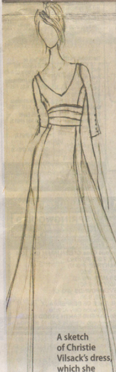
A sketch of Christie Vilsack's dress, which she